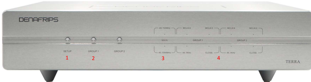
Figure 1. Front Panel