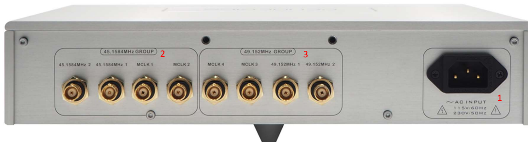
Table 2. Rear Panel